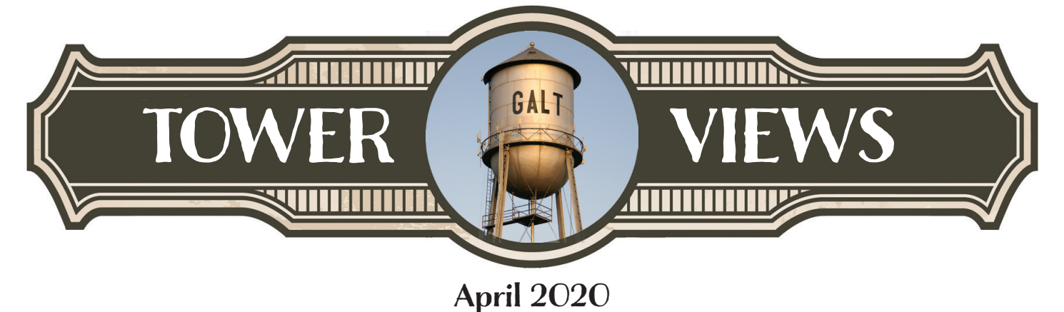
Galt Area Historical Society, Inc. Arno · Clay · Colony · Elliott · Galt · Herald · Hicksville · Liberty · Thornton